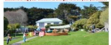
PENINSULA PLAYCENTRE PLAYGROUP

Students bring your Student ID and get 10% off your purchases