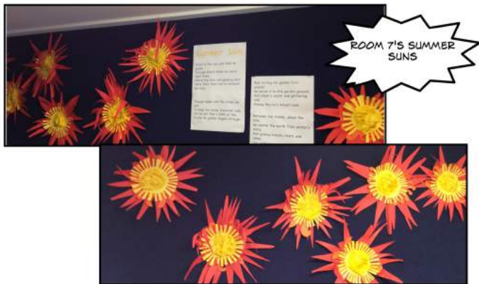
ROOM 7 AT THE TOP OF BALDWIN STREET