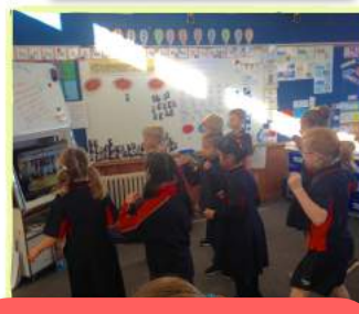
Dancing on 'go noodle'