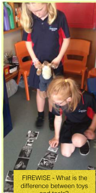
FIREWISE - What is the difference between toys and tools?