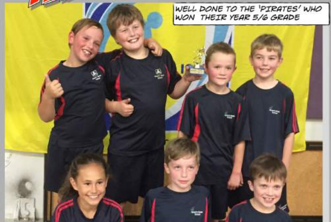
WELL DONE TO THE 'PIRATES' WHO WON THEIR YEAR 5/6 GRADE