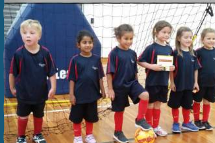
THE AWESOME 'NUGGETS' TEAM COME 2ND IN THEIR GRADE