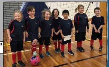
THE 'SPARKS' TEAM HAVE HAD A LOT OF FUN THIS SEASON